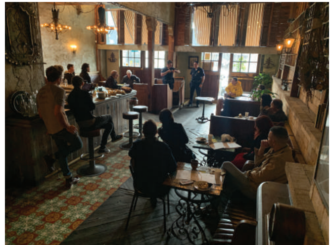
Melrose Merchant Mixer